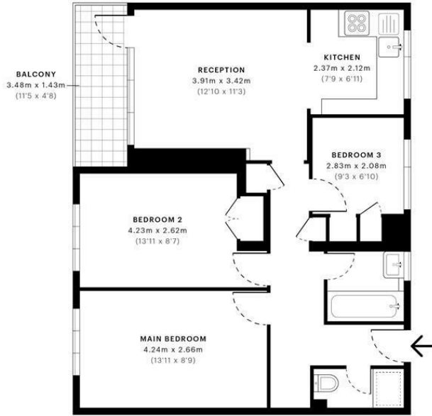
— Third Floor